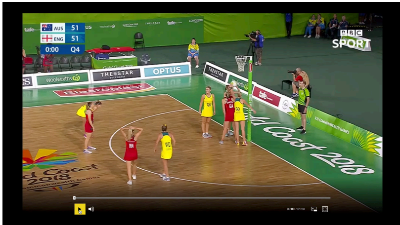
Attitude is a Barometer for Success