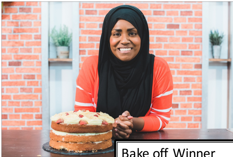
Bake off Winner