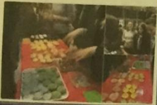
Amazing effort from our year 8s and Year 10s at the Student Council cake sale. £69.44 raised