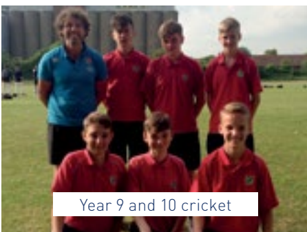
Year 9 and 10 cricket

Athletics has dominated sport this term. The Year 9 and 10 team competed at the District championships in May, with seven students qualifying for the County team. The Year 7 and 8 team took part in the same event at the end of June and came third out of nine schools competing and a very impressive nine students qualified for Country representation. This highlight was the Year 7 boys relay team winning by over 20 meters in their final.