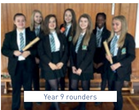
Year 9 rounders

The Key Stage 4 GCSE PE boys have also had an opportunity to compete in Rounders, with a recent tournament held at Harrow Way. With four teams entered, the boys played three full games in a tightly fought contest. We're delighted to report that the Harrow Way team finished eventual winners.